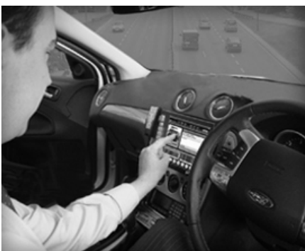
ANPR user interface

The police car used by our local neighbourhood Police Constable Sharon Hill is now fitted with Automatic Number Plate Recognition (ANPR) technology. There are two rear mounted and one forward facing cameras in the car capable of reading one number plate a second. The onboard computer system is linked into the DVLA database, along with various Police systems to immediately identify vehicles being driven without insurance, tax, MOT or vehicles otherwise of interest to Police, such as those used by disqualified drivers or suspected drug dealers.