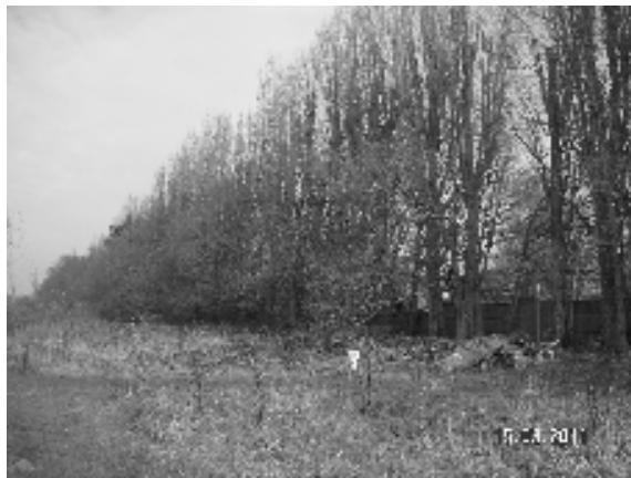
Poplars backing onto Westbury Road houses

Sandy Lodge Golf Club celebrated its Centenary in 2010 and has made several recent improvements to the Golf Course. The Course has been in beautiful condition and receives many accolades from visitors. The Club's Green Keepers actively manage the terrain to enhance the enjoyment of golfers as well as walkers on their footpaths. The site has considerable geological, historical and wildlife interest. There are three main tree lined boundaries to the Golf Course. On the southern boundary we are responsible for the Lombardy poplars which line the backs of the houses parallel to Westbury Road. On the western boundary the Club is responsible for the trees overhanging both the public footpath, part of the London loop, and the metropolitan line track which run parallel to each other, stretching from the rear entrance of Moor Park Station to the bottom end of Westbury Road. On the northern boundary we are responsible for the trees within