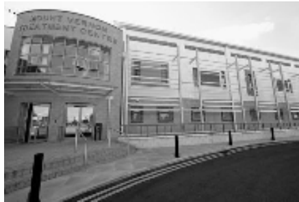
Mount Vernon Hospital

Mount Vernon is now thriving after major investments in the Cancer Centre and the Treatment Centre. Both centres appear to be safe for at least 20 to 30 years.