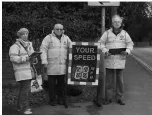
Volunteers at work

Experience from other Police areas shows that Community Speed Watch (CSW) activity can reduce traffic speed. CSW is complementary to, and not a replacement of, conventional Police speed enforcement which will continue to take place.